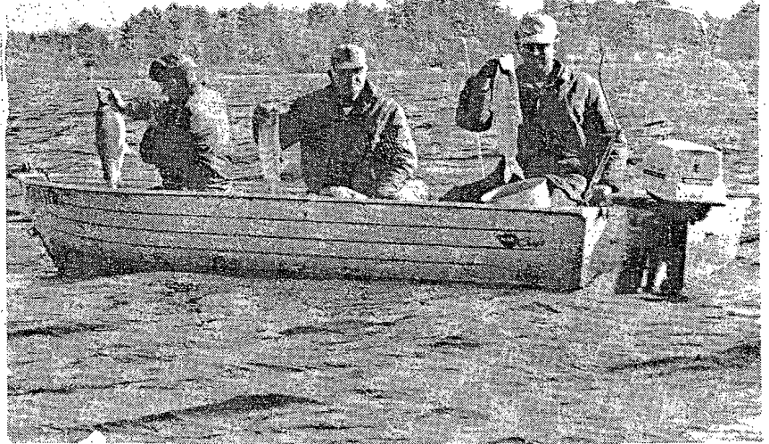
Two end anglers in nearby boat got whitefish, too, off Deep Water Point. Center fisherman picked up a lake trout in deeper water before they anchored on whitefish grounds.

BLAST FROM THE PAST REPRINTED FROM THE MICHIGAN STEELHEADERS-GUIDE TO GREAT LAKES SPORT FISHING