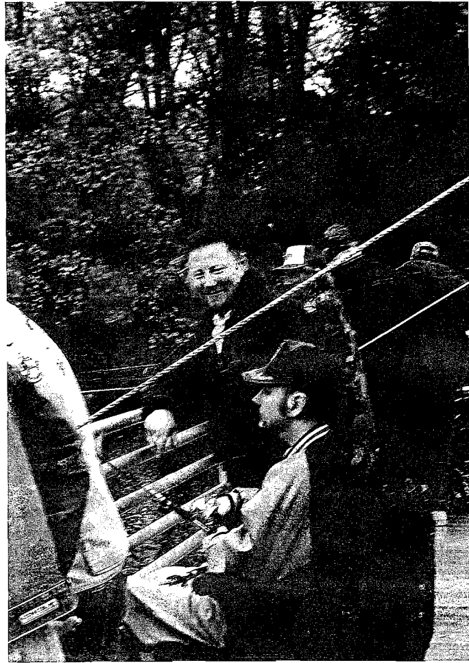
VETERAN'S HOME FISHING DERBY